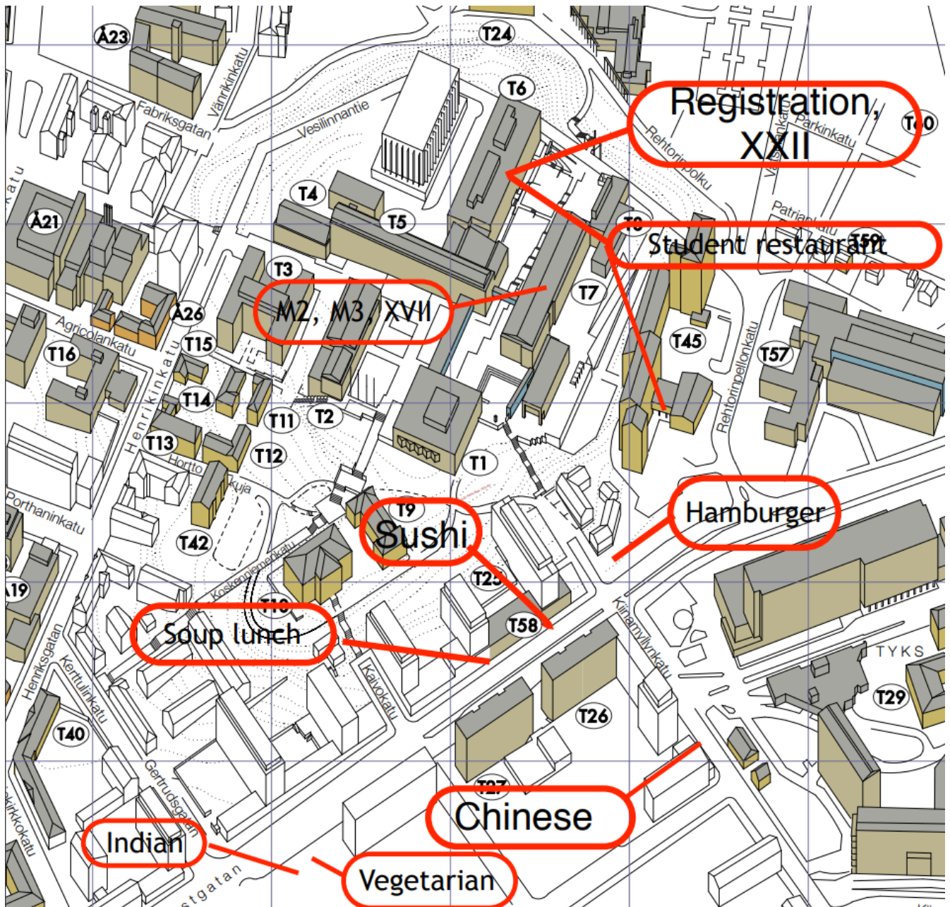
Map of the campus

Wifi: Available wifi connections include Eduroam and UTU visitor . The former should work automatically if your home university supports it and the latter is not a secure connection and needs to be refreshed every 8 hours.