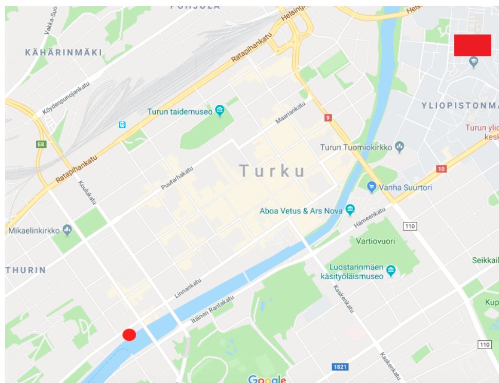
The location of Ukkopekka marked with a dot and the university of Turku with a rectangle.

Live music will be playing throughout the evening on the cruise – not only on board, but also in Loistokari. Let the rhythm of the music and the magical atmosphere of the Finnish archipelago take you and dance on the pier!